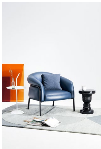
Belly Lounge Chair(CQ-5146)

The steel frame of Belly Lounge Chair was finally determined by grado R&D after 5 proofing sessions and eliminating several sets of plans. As a symbol of elegance, every angle of inclination is worthy of repeated deliberation. The rounded design of the backrest also highlights the softness of Chinese women. Embedding steel frame in the backrest. It draws the outline of a woman's unique curve.