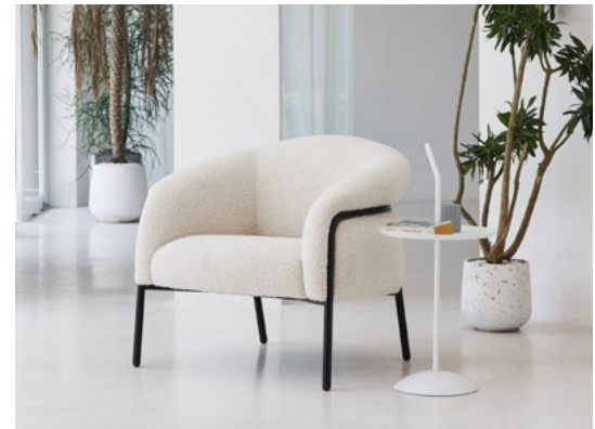
Belly Lounge Chair(Maya 2267-2A)

Women always maintain the elegance. It is the most respectable existence in the world. The designer hopes to express the elegance in a concrete form. So he designed Belly Lounge Chair.