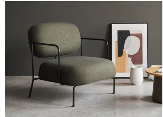
Beatles Lounge Chair(Gabriel Medley GM-68005)

Beatles Lounge Chair has a very classic beetle modelling. A framework of Nordic Akamatsu is adopted internally and a highly soft sitting sense is brought by the high density of sponge. The soft package, in combination with curve elements of the beetle shape car door, highlights the rounded curve that is alike a beetle's back.