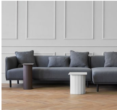
Doric Table(Brown) Doric Table(Light grey)

A set of two height size, placed together to form the collocation of strewn at random discretion. It creates a dilapidated atmosphere in the ruins of the Greek necropolis. Tall mesa can extend into the sitting area of sofa, need not get up to be able to put the thing such as mobile phone or TV control there. The low style platform is large, steady and honest, which can be used as the main tea table.