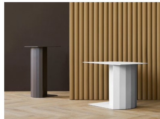
Doric Table(Brown) Doric Table(Light grey)

The Doric inspiration come from the Greek classical columns. Designer Chen Wei combined the elements of ancient Greek architecture design with modern furniture technology, using the bend steeled plate bending process to create an abstract concise polyhedral shape the column, this is stylist in the exploration of light and angle. Doric takes on a completely different shape of different angles, and the semi-enclosed multiple facades guide the direction of light in the space. The soft light, dark transition and the abrupt turning of the corner form a strong contrast of light and shadow.