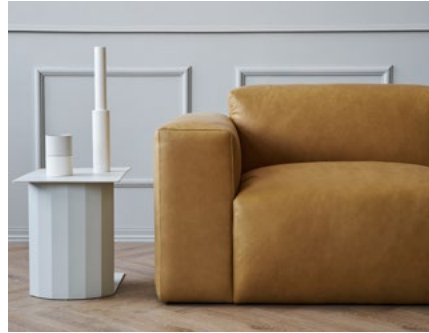
Doric Table(Light grey)

On the choice of color and the surface material, fine sanded grain surface treatment to simulate the Greek marble texture image. Gray white makes the vision more comforts, also accord with the image characteristic of marble. Dark brown is more historical. High and low collocation, contrast and harmony are unified with each other, elegant and lasting.