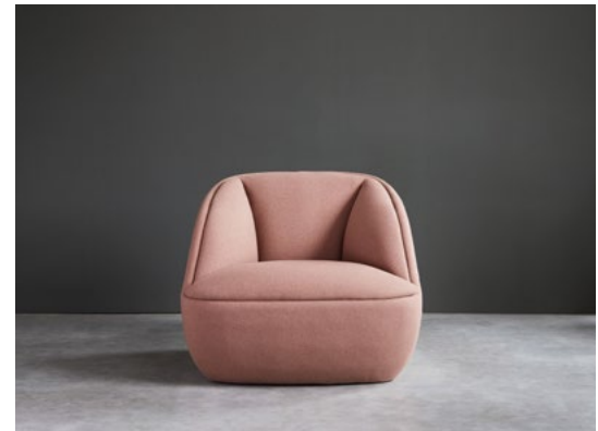
Lip Sofa (OTE Sunday 10)

It is the warm and soft lips that inspired us to make the Lip Sofa. It's a cleverness for this sofa's design, by showing the structure of the lips, the upper lip is changed into the sofa back, the lower lip into the base, and the tongue, is converted into the cushion.