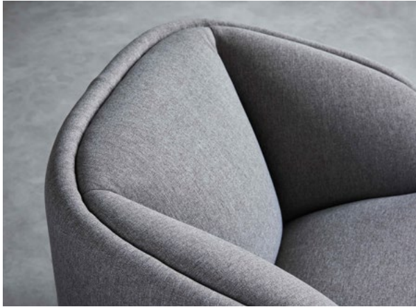
Lip Sofa (Gabriel Medley GM60167)

The peak and the valley of lip are transformed into the backrest waist curve and the concave turns correspondingly. It looks perfectly round, cute and pleasing. About the application, Lip could be applied to the hotel lobby, leisure area, cafe, library, home and other scenarios.