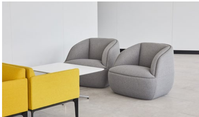
Lip Sofa (Gabriel Medley GM60167)

The peak and the valley of lip are transformed into the backrest waist curve and the concave turns correspondingly. It looks perfectly round, cute and pleasing. About the application, Lip could be applied to the hotel lobby, leisure area, cafe, library, home and other scenarios.