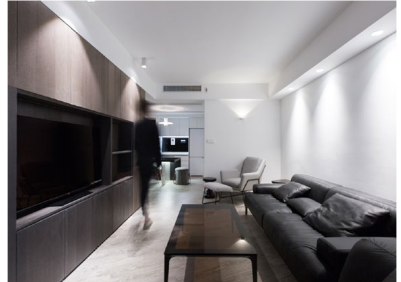
Luna Sofa-L shape seat(PU Leather PL-01)