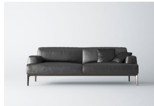
Luna Sofa-Double seats(PU Leather PL-01)

The elegant Luna came from the Dada, Alex continued to use the elements of the high heels on the sofa. While supporting the entire seat and ensuring the comfort of the Luna, the close combination of back and armrest cushion makes integral line simple and elegant. The angle between the seat and backrest is totally based on human engineering to meet users' need of comfort.