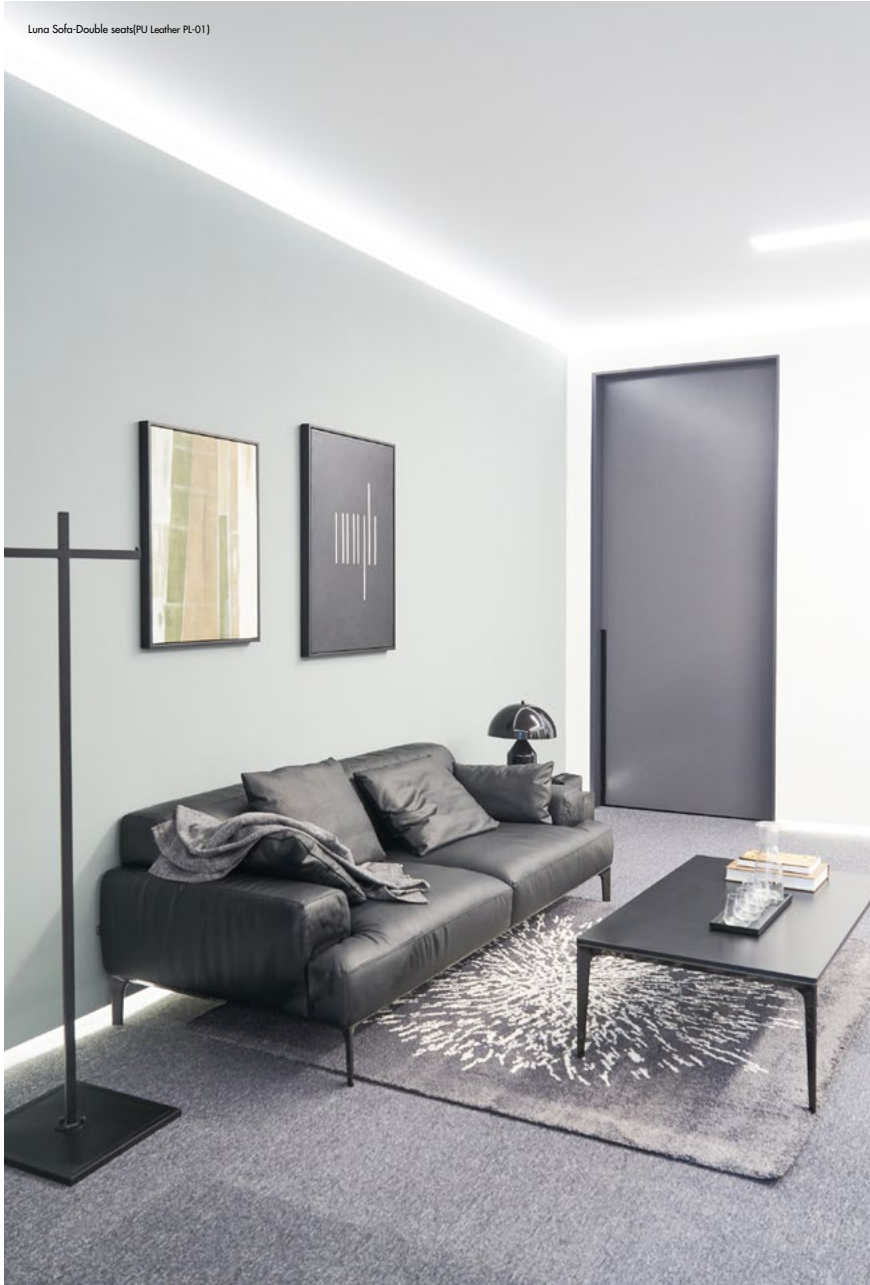
Luna Sofa-Double seats(PU Leather PL-01)