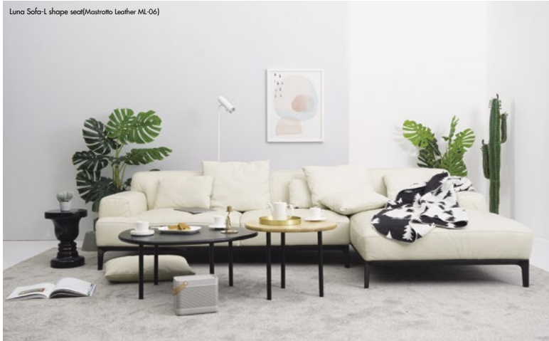
Luna Sofa-L shape seat(Mastratto Leather ML-06)

The inside structure is solid wood and elastic strip suspension seat, besides the soft foam, we inject the further into this sofa, giving user high-level seating feeling. Slender aluminum legs, the same with da da series, impart a feeling of grace to the environment. Luna Sofa is suitable for any public or private space, especially for waiting room, reception, and home.