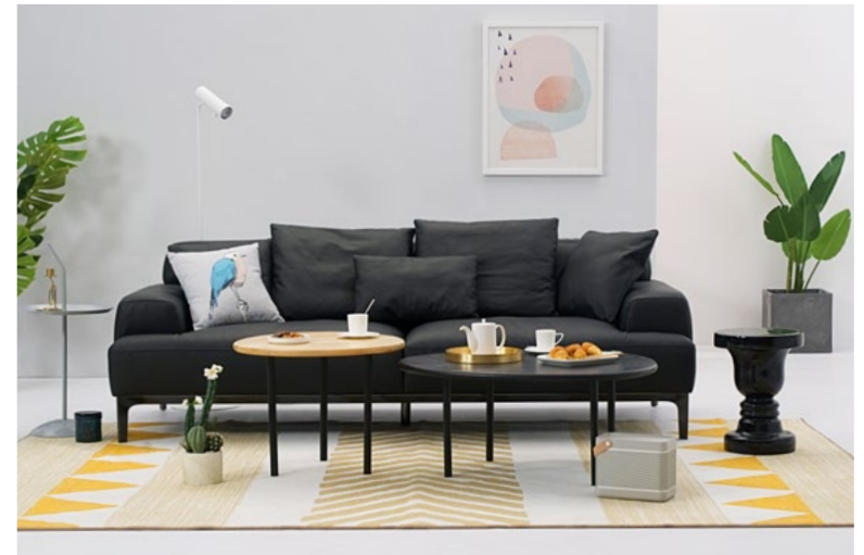
Luna Sofa-Double seats(PU Leather PL-01)